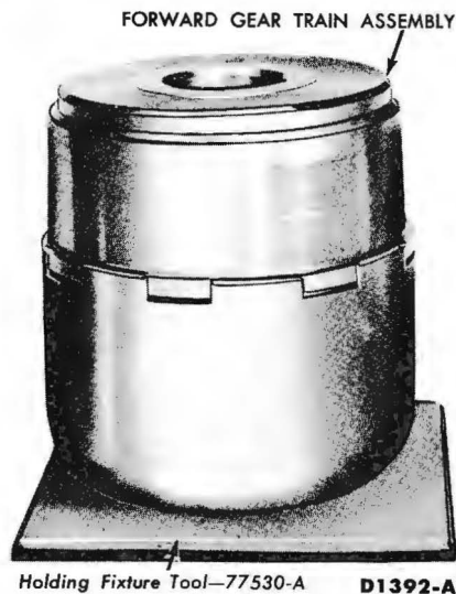
FIG. 13—Forward Part of Gear Train Positioned in Holding Fixture